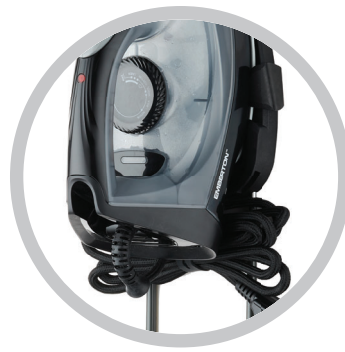
INTEGRATED CORD WRAP Cord may be neatly wrapped using Silicone Cord Wrap