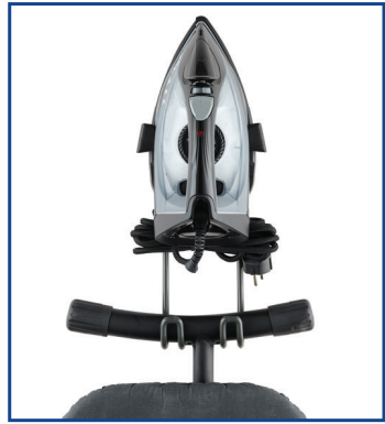
Wall Mounted Iron & Board Safety Store Holder