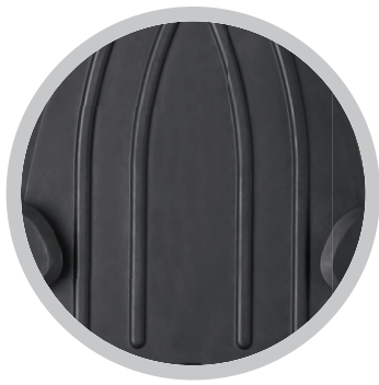
HEAT RESISTANT PROTECTIVE IRON PAD to prevent sole plate damage and absorb heat