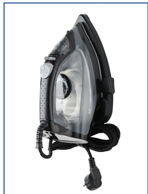
Suits and Fits almost all Iron Types & Sizes