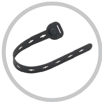
SILICONE CORD WRAP to secure iron cord neatly